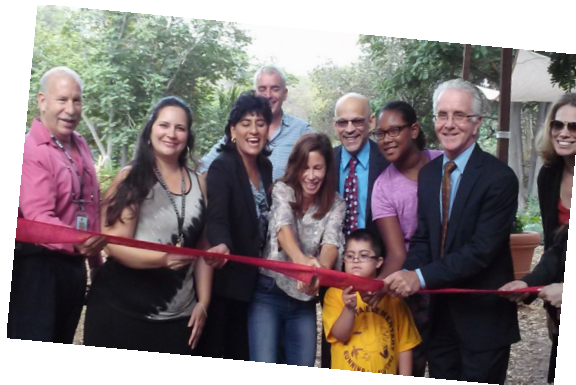
with community representatives and Local District staff cutting the Ribbon