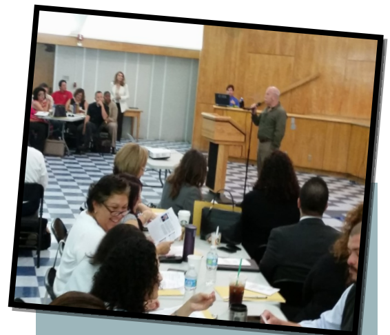
speaking to the Northwest principals

For more information on other Local District Northwest initiatives please visit: http://achieve.lausd.net/northwest