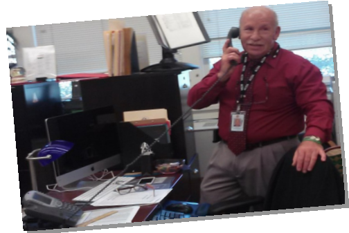
Board Member at Lawrence Middle School